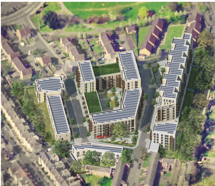
Aerial view of the new Sherwood Close

The design team are delighted to announce that the planning application for Sherwood Close has been successful with all members of the committee voting in favour of the scheme. We would like to thank residents for their support especially the resident steering group who have been with us every step of the way, including writing a letter of support for the redevelopment.